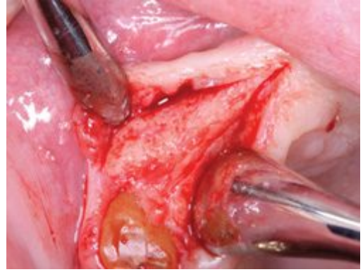
Fig. 6: Mesial and distal to remaining teeth is almost always a triangle of dense bone into which an implant can be placed.