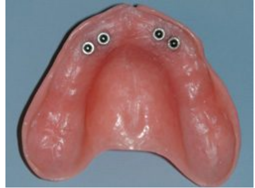
Fig. 4: Housings in maxillary denture with rubber washers in the housings providing support and retention for the denture.

SDIs were met with both enthusiasm and ridicule. Those practitioners who took the time to learn to use SDIs found repeated success for numerous indications, but some dentists considered them only transitional in nature, and this impeded the growth and acceptance of SDIs.