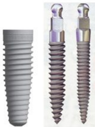
Fig. 1: "Mini" or small-diameter implants are considered by most to be less than 3 mm in diameter, while conventional-diameter implants are 3 mm and larger in diameter.

A From the time they were introduced, small-diameter implants (SDIs) have been criticized by some dentists and loved by others. The mini-size implant is usually considered to be up to 2.9 mm in diameter with a typical length of 13 mm (Fig. 1). I am frustrated about why this size of implant has been controversial, and I have some answers for you.