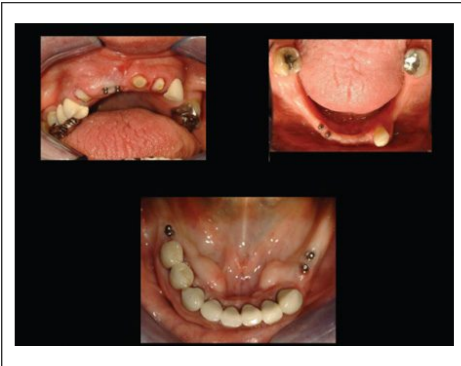
Fig. 7: Examples of small-diameter implants used with removable partial dentures.

Use of SDIs as support and retention for removable complete and partial dentures is safe and predictable when accomplished properly. The other uses described here need additional long-term use and observation for validation, and should be accomplished with caution only when other alternatives are not possible.