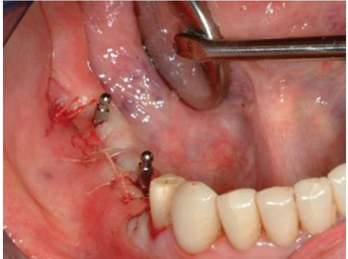
Fig. 2: Two mini implants that were left in place for several months while the bone integrated into conventional-diameter implants placed in the edentulous space.

In the mid-'90s, some dentists began successfully using SDIs for support of complete dentures (Figs. 3 and 4). Pure titanium, the initial composition of SDIs, was soon replaced with titanium alloy, which has greater strength. Etched and/or blasted surfaces began to be placed on the external of the titanium alloy SDIs. The external surfaces on the SDIs were then comparable to conventional-diameter implants.