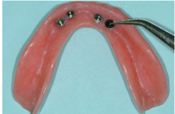
Fig. 5: Typical mandibular denture with four small-diameter implants providing denture support and retention.

1) Fully edentulous mandible. This is by far the most significant indication. The bone in this indication is usually dense and strong with minimal trabeculation porosity (Type 1 bone). Usually, four SDIs spaced from canine area to canine area are adequate (Fig. 5). Seldom does failure occur in such locations unless the implant is placed improperly (described later).