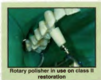
Rotary polisher in use on class II restoration

Results: All systems evaluated produced clinically acceptable polish when using proper techniques and sufficient time. Overall, the Astropol/Astrobrush system ( Ivoclar Vivadent ) received the highest ratings.