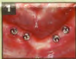
Small Diameter Implants