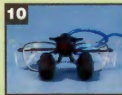
Magnification with Headlamp