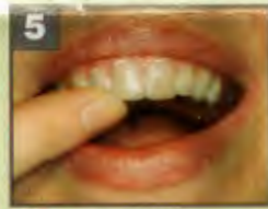
Whitening (Bleaching) Teeth