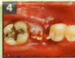
Bone Regeneration and/or Ridge Preservation