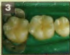
Class II Resin-based Composites