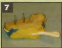
Double Arch Impression