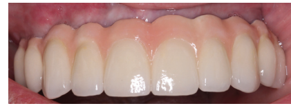
Figure 8: Mini implant bridge 1 month post-op

with a Water Pik® and toothbrush. Upon removal of the modified denture, the oral cavity, implants, and prosthesis were free of debris. With this information, a treatment plan was formulated to place an additional three mini implants to support a 10-unit fixed partial denture 10-unit FPD (Evolution Dental Lab) (Figure 5).