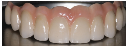
Figure 7: 10-unit bridge