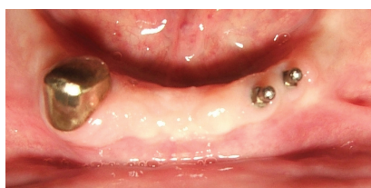
Figure 5: 2-year clinical re-evaluation