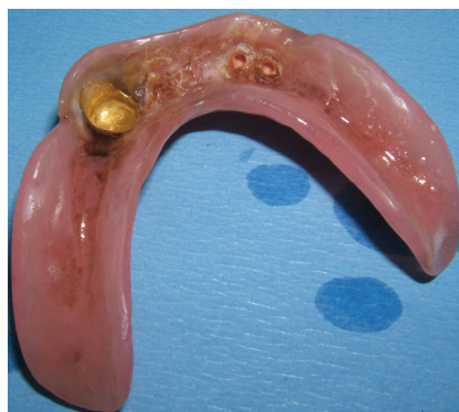
Figure 4: Prosthetic re-evaluation after 2 years