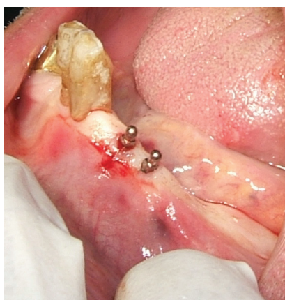
Figure 2: Mini implants placed, no bleeding