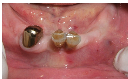
Figure 1: Initial situation, before surgery