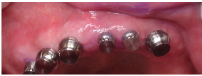
Figure 6: OCO Mini® implants with retentive housings