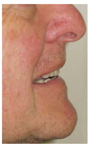
Fig. 11: Patient full face with proper lip support and correct VDO