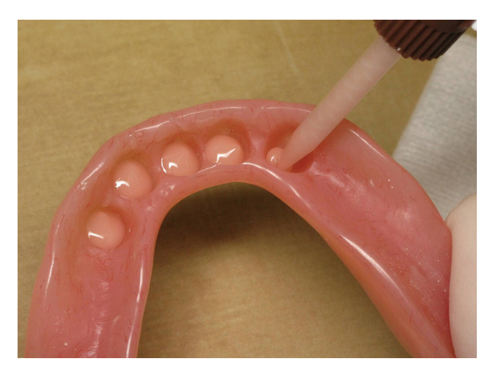
Fig. 8: Chairside pickup material injected into lower denture