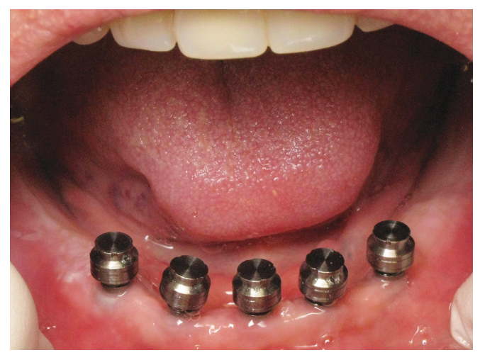
Fig. 7: Mandibular ridge with mini implant retentive housings