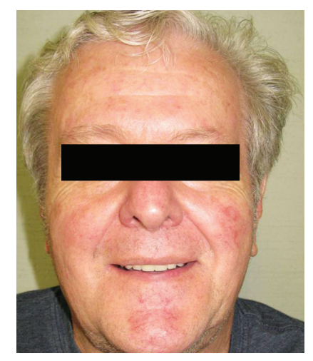
Fig. 10: Patient full face with proper lip support and correct VDO