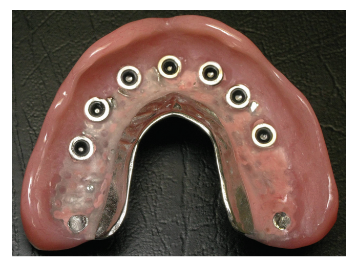
Fig. 6: Final cast metal overdenture with retentive housing inserted

ridge augmentation. The advent of the mini dental implant has given general dentists an easy, less costly, and rapid way of solving many of the difficult problems that arise in dental practice with complete dentures (Figs 10 and 11).