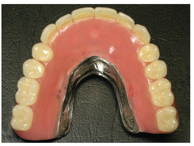
Fig. 5: Final cast metal reinforced upper overdenture