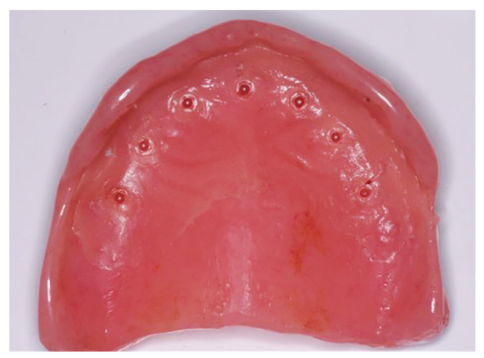
Fig. 4: Soft lined upper full denture

Once the implants were placed, the denture was relieved to allow full seating of the denture with no rocking on the implants. A soft liner was placed and impressions taken to fabricate a metal-reinforced horseshoe-shaped denture (Figs 4 and 5). Once the new metal frame was returned from the lab, the traditional steps to fabricating a complete denture were followed. After the final wax setup was approved, the denture was finalized. The undercuts below the O-balls were blocked out. The cleaned and dried recesses that were created in the denture were filled with self-cure acrylic and seated onto the implants and allowed to polymerize. Upon setting, the denture was relieved of any excess flash and any voids were filled in with pink composite (Figs 6 and 7). The patient was very pleased with the fit, function, and esthetics of the new denture. This same process was repeated on the lower arch with five mini dental implants (Figs 7 to 9).