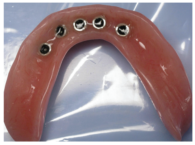
Fig. 9: Final retentive housing secured into lower denture