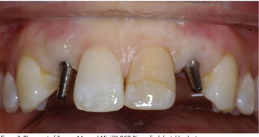
Figure 2: Placement of 3 mm x 14 mm I-Mini™ OCO Biomedical dental Implants

After the 3 mm x 14 mm I-Mini<sup>™</sup> OCO Biomedical implants were placed